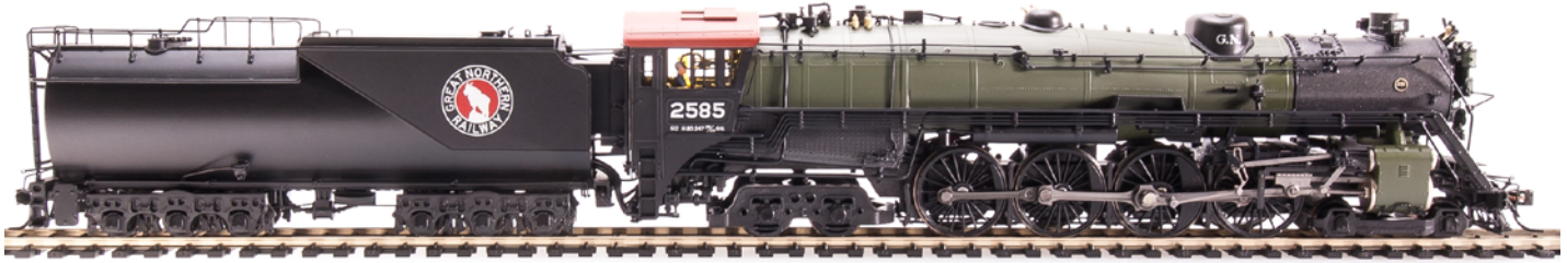
Actual Vestibule Cab version production model pictured.

EXPECTED DELIVERY: FALL 2015 ORDER DEADLINE: 4/3/15 MSRP: 699.99