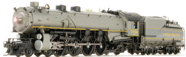
Two-tone Gray w/ Yellow / Coal Tender