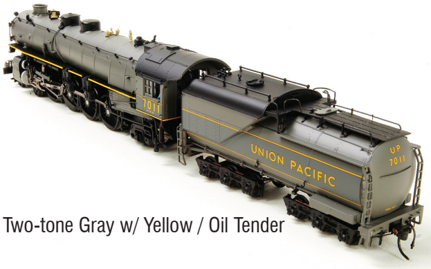
Two-tone Gray w/ Yellow / Oil Tender