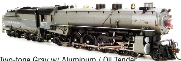
Two-tone Gray w/ Aluminum / Oil Tender