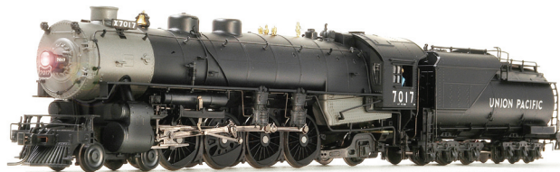
Black & Graphite / Oil Tender